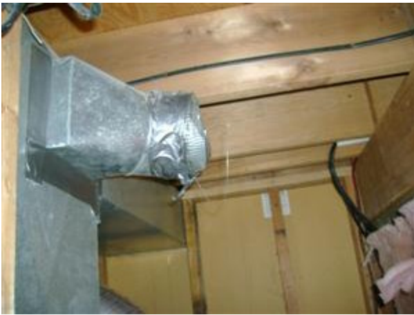
10.3 Picture 1

10.3 One of the cold air return ducts is missing.( Picture 1 )