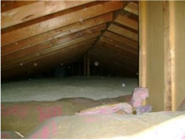
1.5 Picture 1

The roof of the home was inspected and reported on with the above information. While the inspector makes every effort to find all areas of concern, some areas can go unnoticed. Roof coverings and skylights can appear to be leak proof during inspection and weather conditions. Our inspection makes an attempt to find a leak but sometimes cannot. Please be aware that the inspector has your best interest in mind. Any repair items mentioned in this report should be considered before purchase. It is recommended that qualified contractors be used in your further inspection or repair issues as it relates to the comments in this inspection report.