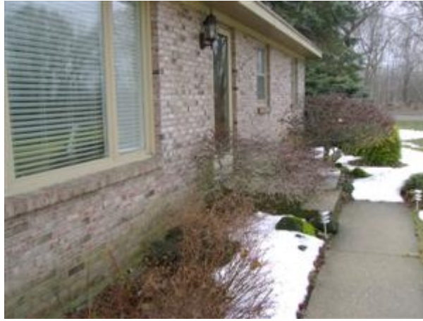
2.4 Picture 2

The exterior of the home was inspected and reported on with the above information. While the inspector makes every effort to find all areas of concern, some areas can go unnoticed. Please be aware that the inspector has your best interest in mind. Any repair items mentioned in this report should be considered before purchase. It is recommended that qualified contractors be used in your further inspection or repair issues as it relates to the comments in this inspection report.