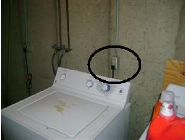
9.5 Picture 1

9.6 The electrical panel is located in the basement in the northwest corner, in the theatre room.