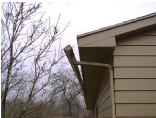
1.4 Picture 1

1.4 Gutter is pulling away from the house on the back.( Picture 1 )