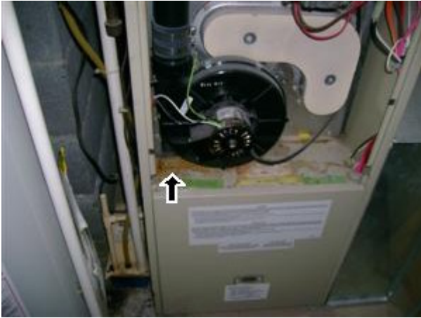
10.0 Picture 1