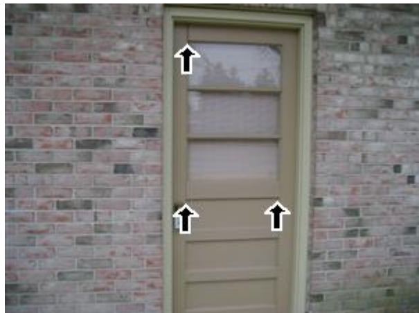
2.1 Picture 1

2.1 Door is coming apart, need to budget to be replaced.