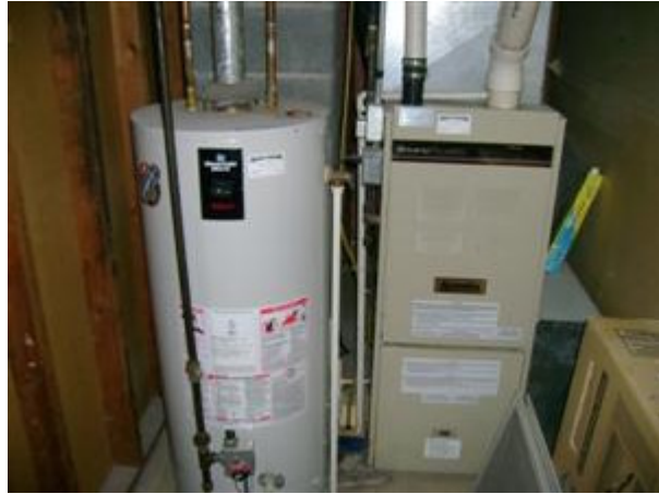
10.0 Picture 2

10.3 One of the cold air return ducts is missing.( Picture 1 )