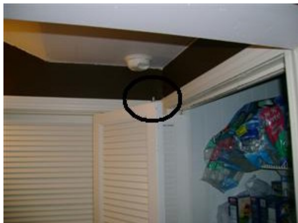
5.4 Picture 1

5.4 The bifold closet door in the basement is missing hardware. ( Picture 1 )