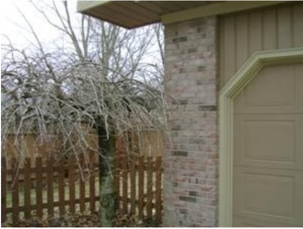
2.4 Picture 1