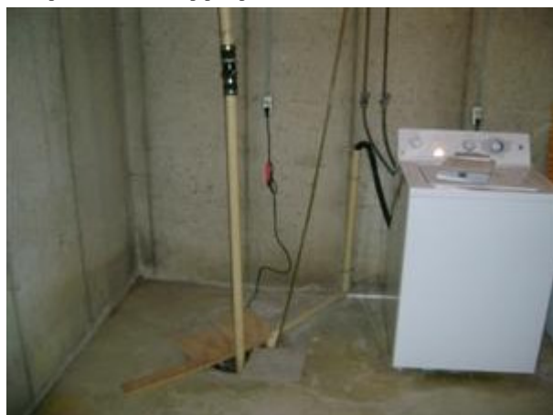
8.6 Picture 1

8.6 A picture of the sump pump in the basement. Discussed all concerns with the sump pump.( Picture 1 )